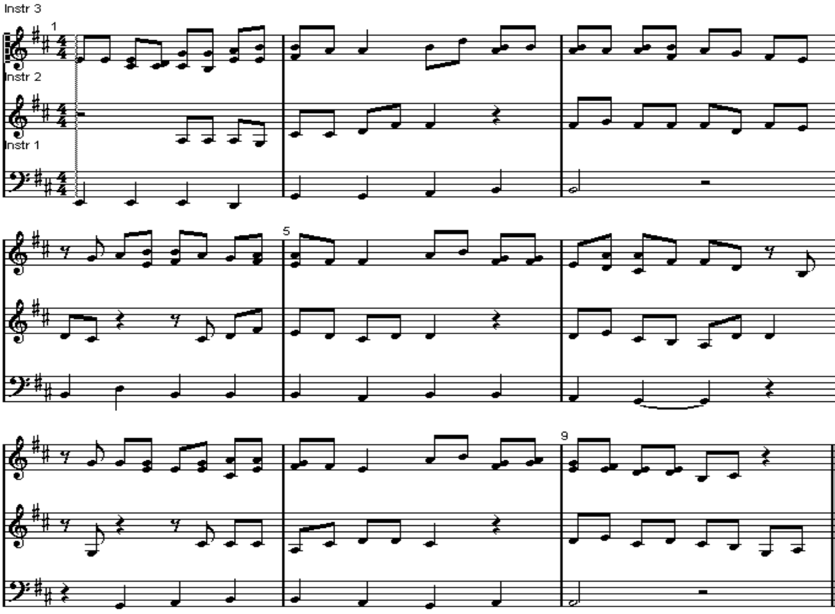
Figure 3. Production of a Music Graph.

In syntax and textual representation, MML is a dialect of Extensible Markup Language (XML) (World Wide Web Consortium 1998). Each element of MML is prefixed by a start tag and postfixed by an end tag. However, MML is simpler than XML. Tags never have attributes; all start and end tags are followed by newlines; all other lines of text contain either a property name and value, or a vector of numbers; a matrix is several rows of vectors; and files never have Document Type Definitions, because MML is designed to be dynamically extensible.