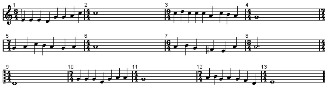
Figure 1. Pange Lingua .

Figure 2 shows the MML editor of Silence, containing a music graph that elaborates this tune.